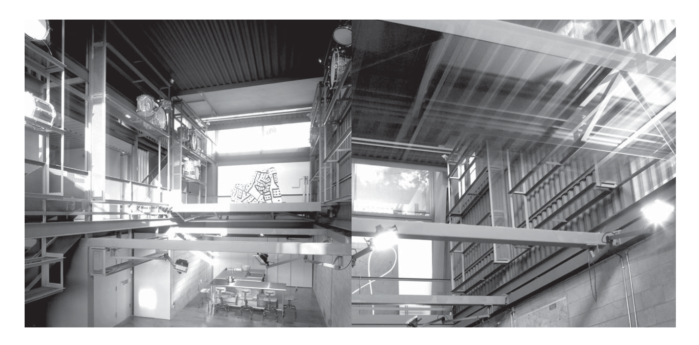
Figure 1. This residence includes a movable mezzanine that can be rolled along the length of its main volume, and can be joined with a small street-facing balcony to make a larger indoor/outdoor space. (Jones, Partners: Architecture)

paradigm is distinguished by a higher value being placed on the information itself than on its particular embodiment. This is in contrast to the era that Walter Benjamin scrutinized in his essay The Work of Art in the Age of Mechanical Reproduction , in which it was still reasonable to speak of the concept of an original work and its derivatives, and to speculate on differences in value between the two. Today, rather, the notion of an original, preferred embodiment of this information is an idea that is essentially meaningless; information content now takes precedence over its form(at). Contemporary society instead values the ability to disseminate, update, and reformulate this content—all of which has been facilitated by the digitization of information.