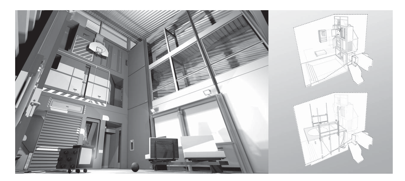
Figure 3. The entire floor plate of this single-person residence is a hydraulic elevator platform. As the occupant moves the floor up and down alongside a vertical program wall it becomes functionally re-programmed, which dramatically alters the character of the space and also serves as a continuous index of daily activities. (Doug Jackson)

An architectural paradigm shift characterized by work that allows individuals to participate in manipulating its physical "content"—such as its formal or spatial relationships—would therefore allow the discipline to respond directly to this cultural dynamic. It would also release the discipline from its