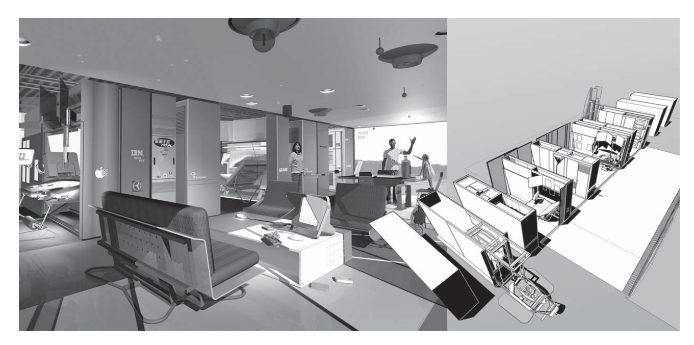
Figure 5. This project features a system of program cabinets that can be slid back and forth within the available volume. The occupants are able to create program-specific spaces between the cabinets as desired, and to eliminate that space and rededicate it to another program as interests change simply by repositioning the cabinets. (Jones, Partners: Architecture)

The open-content model therefore offers a strategy to architecture that not only allows it to once again be culturally relevant, but will also enable it to preserve this relevance in the face of the rapid succession of aesthetic trends and across the long lifespan of its built works. It both accommodates contemporary society's increasing desire for content creation and control and gives expressive form to this desire, celebrating its defining role within culture and thereby producing an architecture that is culturally engaging and meaningful. And it demonstrates the proper way for the discipline to address the digital paradigm-not through an obsession with new tools for digital fabrication and representation or through a fetishization of the imagery and forms enabled by those tools—but rather through a fundamental rethinking of architecture and the character of its authorship based on the changes that digital technologies have imparted to society and culture.